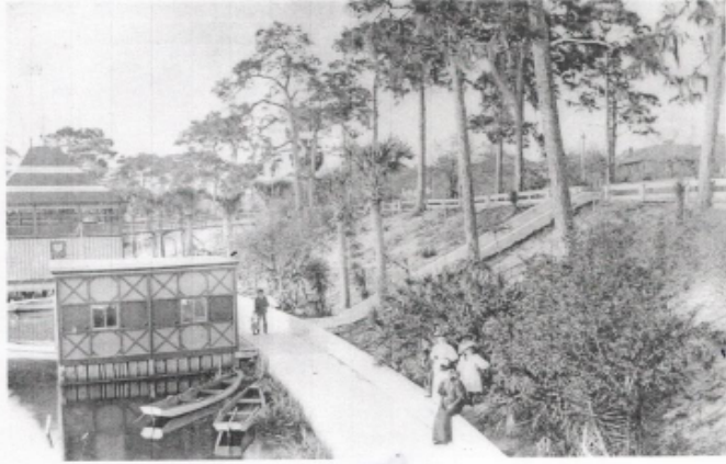
Spring Bayou in late 1800's